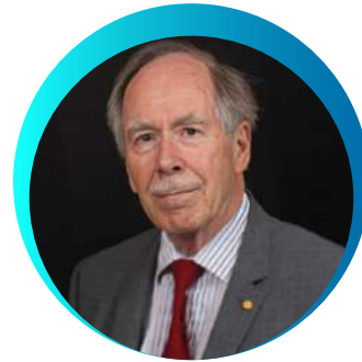
Prof. Gerard 't Hooft Utrecht University Netherlands